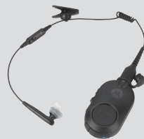
NNTN8294 (Wireless Pod not included)